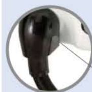
Nozzle with skincare protection

Anti-vandal and anti-theft, high-performance warm air hair dryer, equipped with flexible hose. Sturdy structure made of carbon steel with anti-writer (special treatment that allows easy cleaning of the surface) available on the black and white porcelain version, alternatively stainless steel AISI 304 in satin or bright version. Equipped with SKINCARE & WATER STOP safety devices, Electrical protection level: Class II. Long life motor equipped with LEM patented system which allows fast and easy maintenance. Matching with single or multiple coin box for paying service and with the sliding rail for height adjustment.